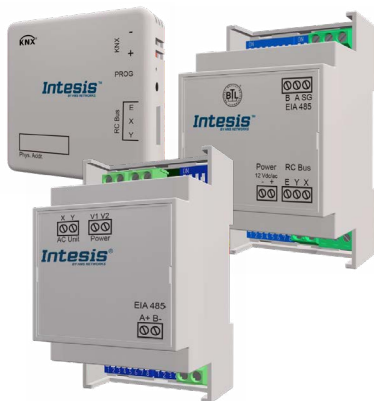
Single Split Gateways

The gateways enable fully bidirectional communication between Systemair Split and VRF systems and a building management system.