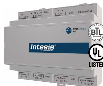
Split & VRF Gateways