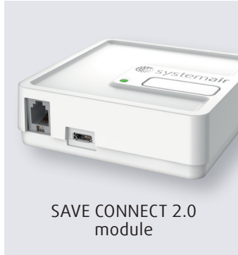
SAVE CONNECT 2.0 module

Connect to SAVE PRO Cloud – professional Ventilation Management platform for B2B partners. Get the convenience of accessing remote and adaptable technical support, troubleshooting assistance, and the capability to monitor multiple own and client devices.